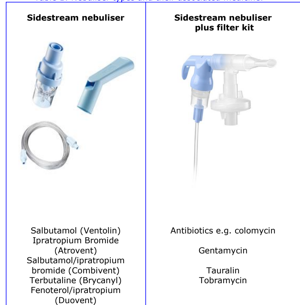
Table 1: Nebuliser types and their associated medicine.

For VENTSTREAM users only: Replace the nebuliser filter after each use.